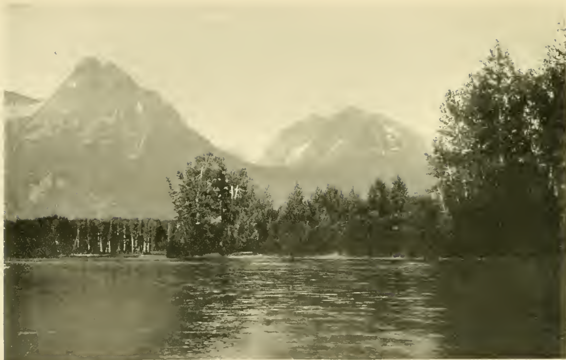
Cone Mountain on Stickeen River.